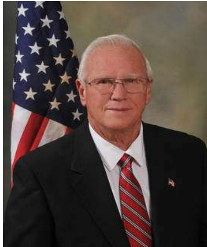
Mayor Jim Heigl